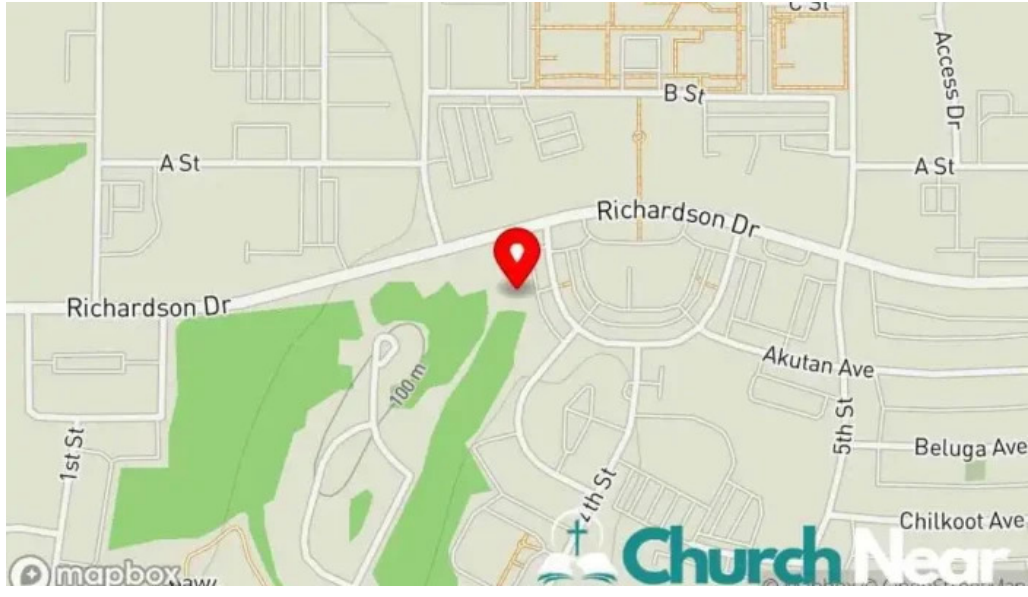
Arctic warrior chapel anchorage