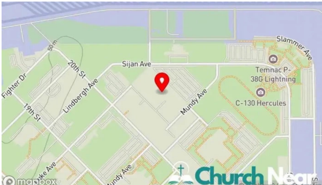
Jber public affairs anchorage