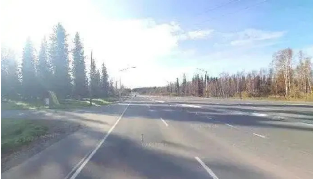
Seventh day adventist gymnasium all