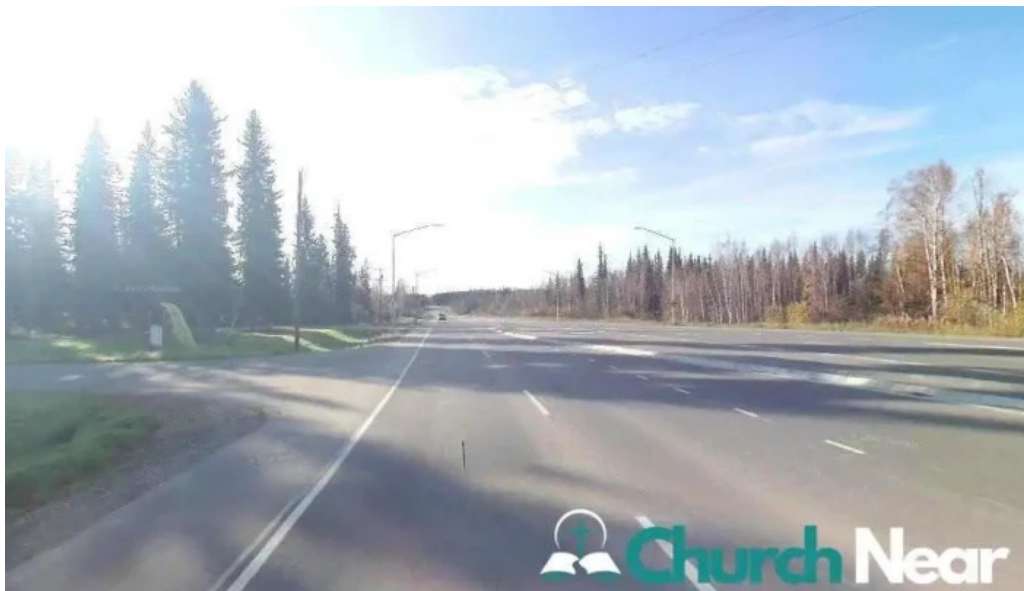
Seventh day adventist gymnasium fairbanks