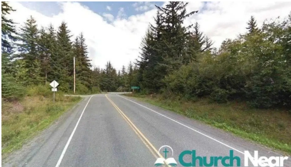
The church of jesus christ of latter day saints haines