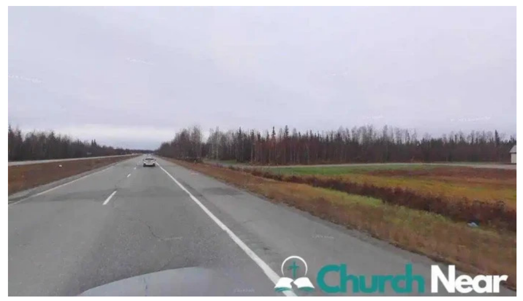
Northern lights fwb church north pole