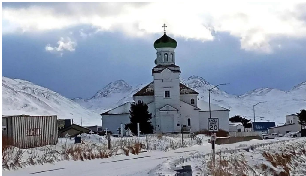
Bishops house all