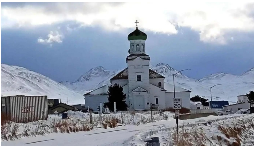
Bishop s house unalaska