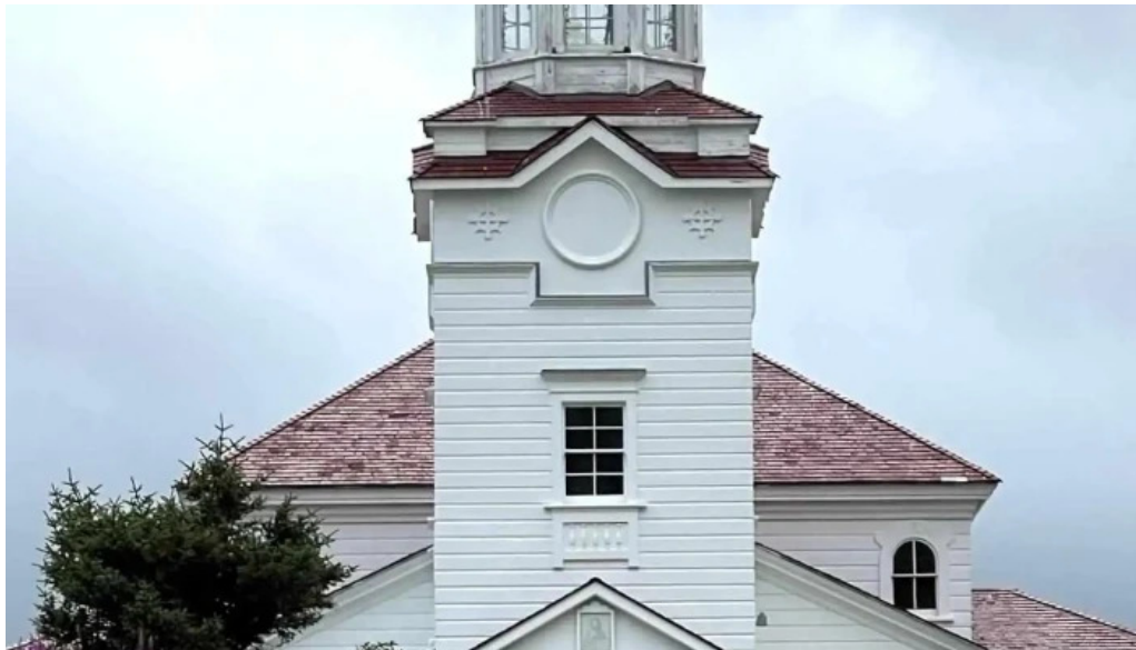
Bishops house church