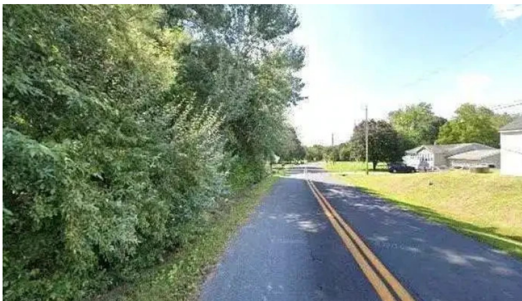
Saint paul church all