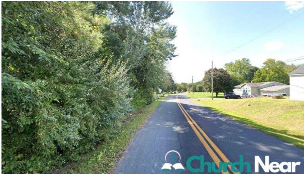
Saint paul church bear