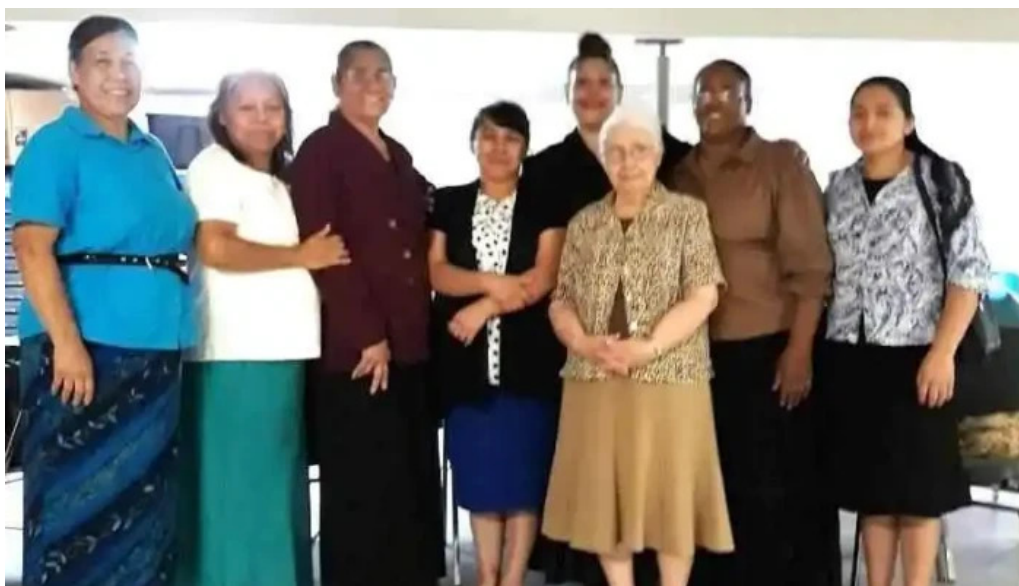
Iglesia pent la senda antigua camden