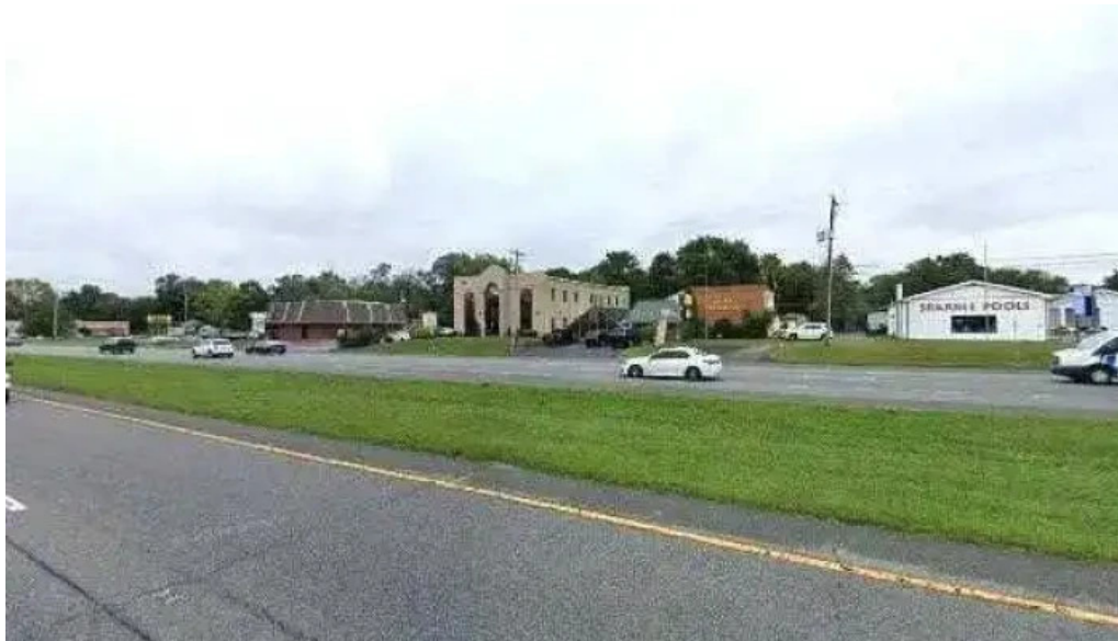
Iglesia pentla senda antigua street view 360deg