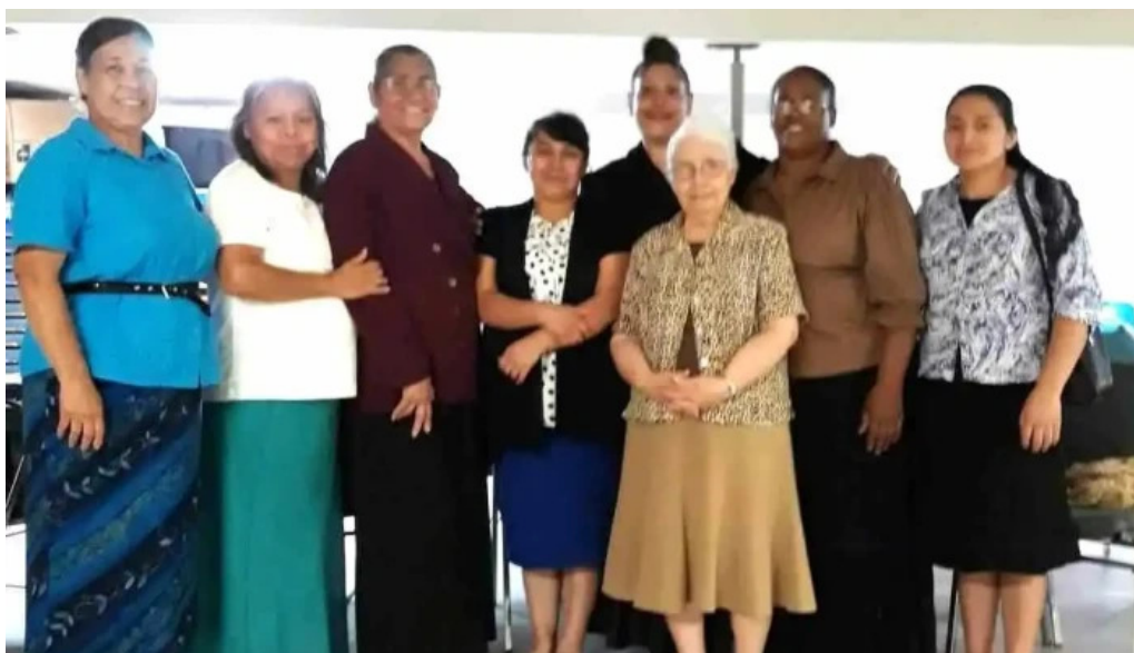
Iglesia pentla senda antigua all