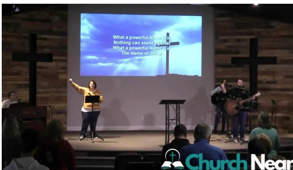
Maranatha fellowship all