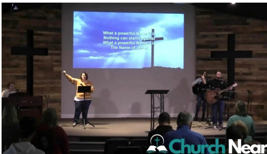
Maranatha fellowship dover