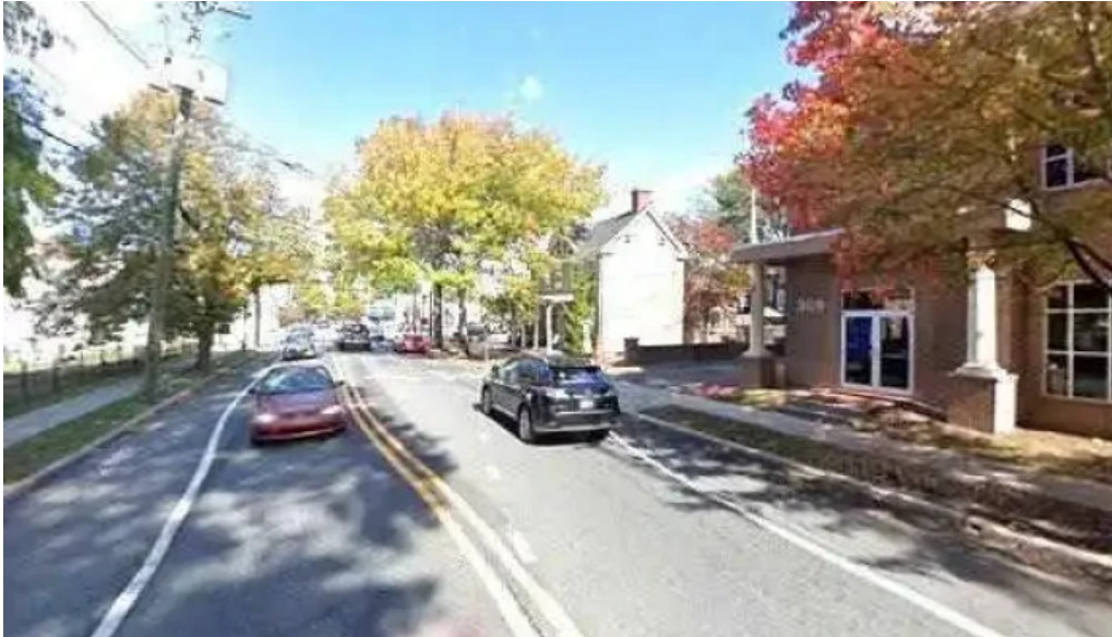
Old presbyterian church cemetery street view 360deg