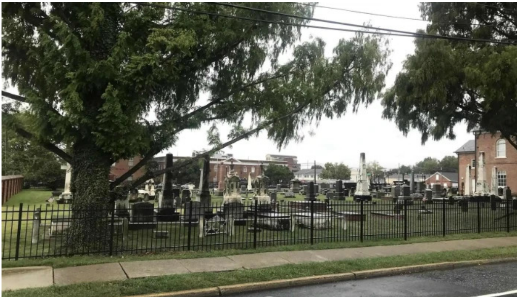
Old presbyterian church cemetery public space