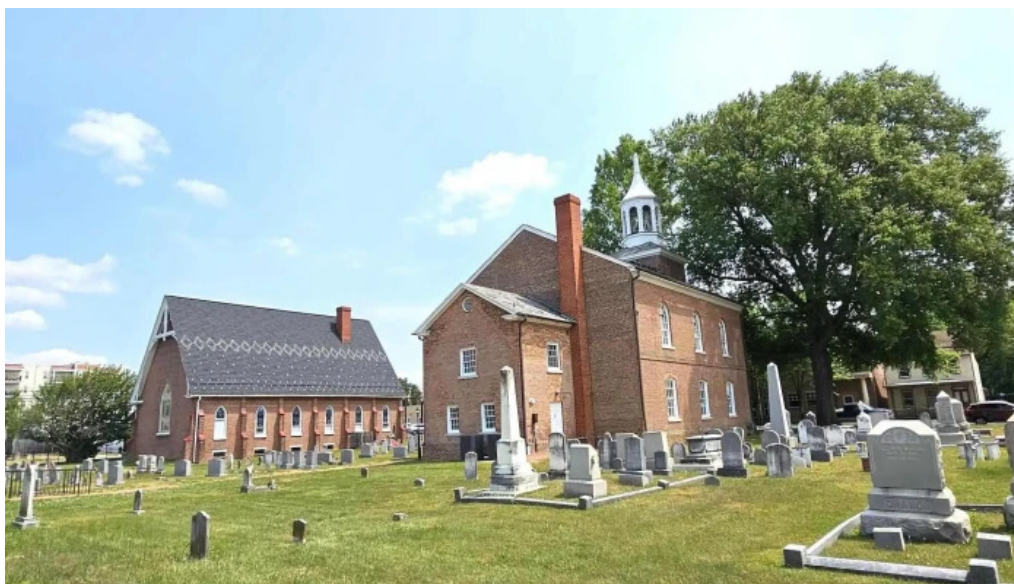
Old presbyterian church cemetery all