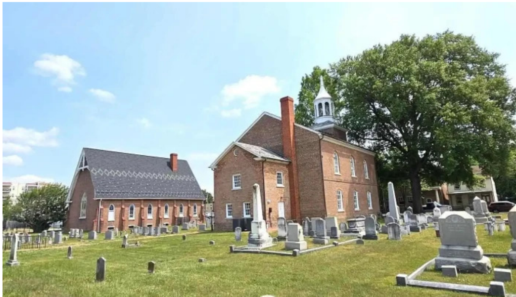
Old presbyterian church cemetery dover