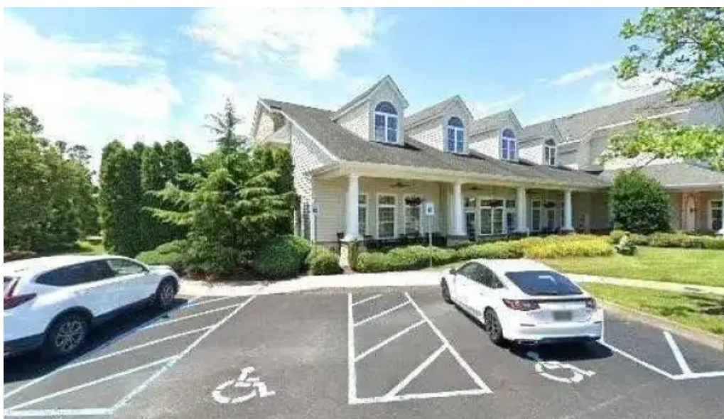
The potters house all