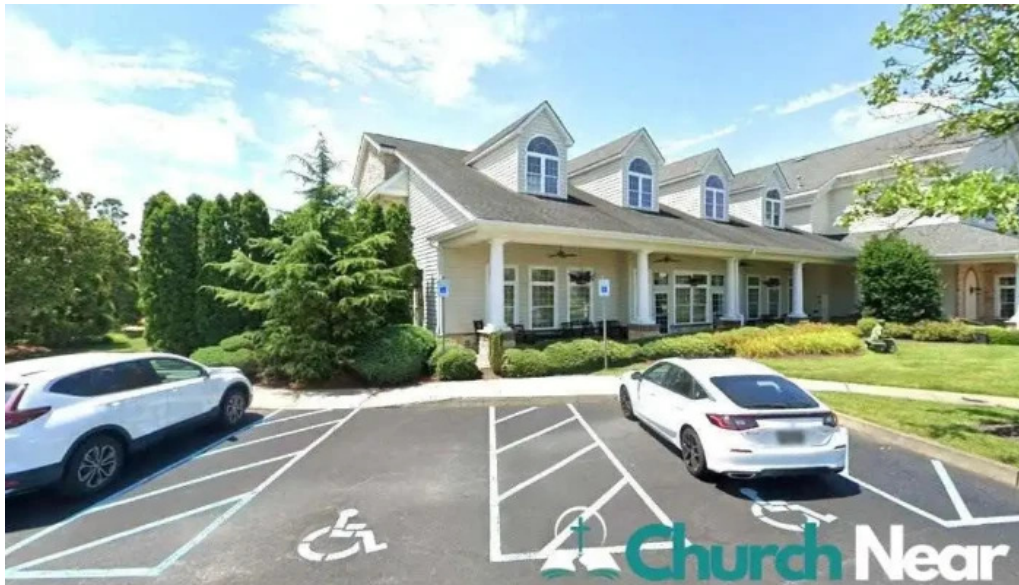
The potter s house dover