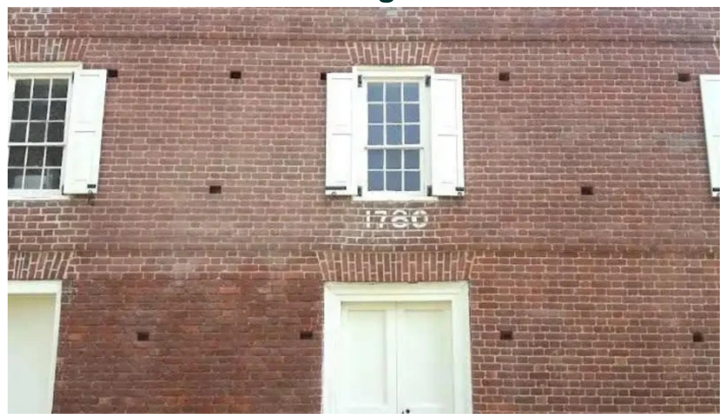
Barratt s chapel museum frederica