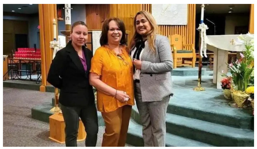
Our lady of fatima roman catholic church new castle