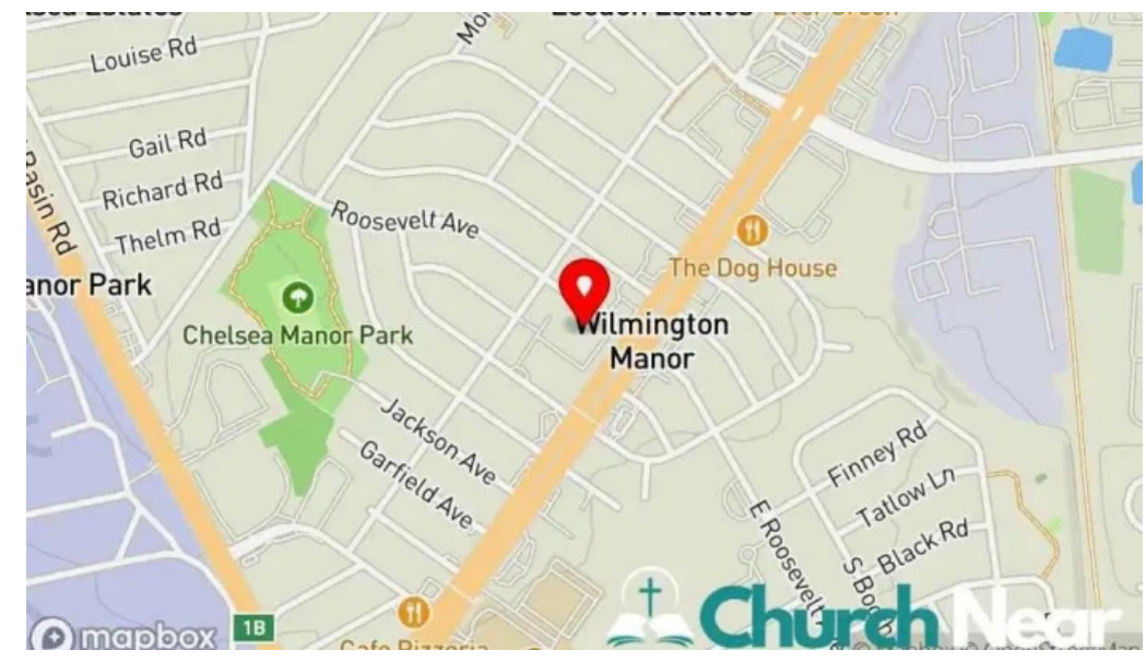
Our lady of fatima roman catholic church map