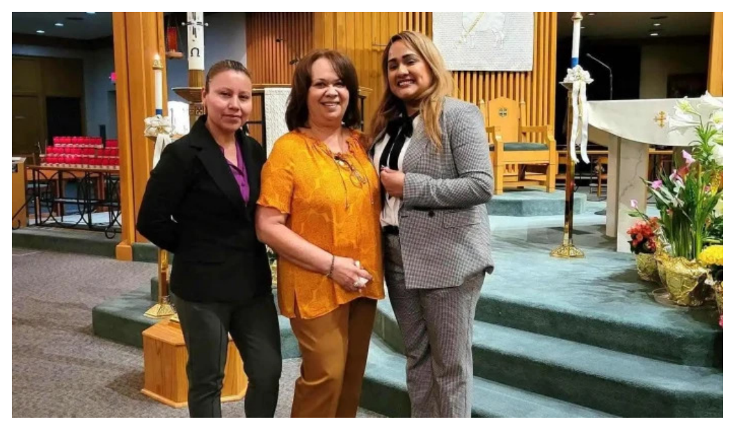
Our lady of fatima roman catholic church all