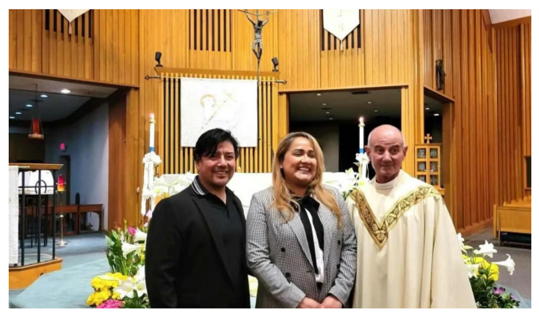
Our lady of fatima roman catholic church church