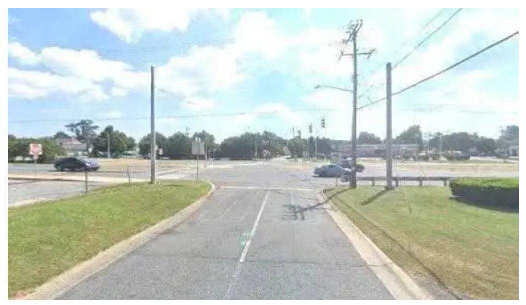
Our lady of fatima roman catholic church street view 360deg

Our lady of fatima roman catholic church videos