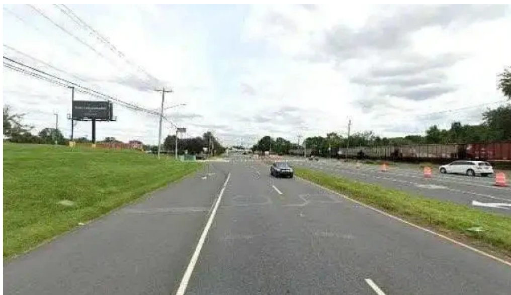
Victory international bible all