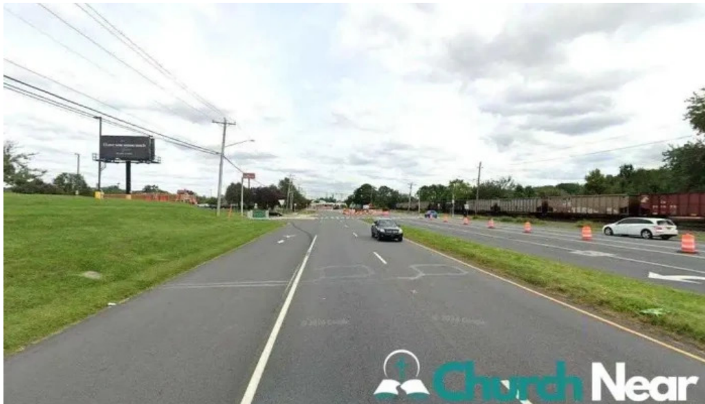
Victory international bible new castle