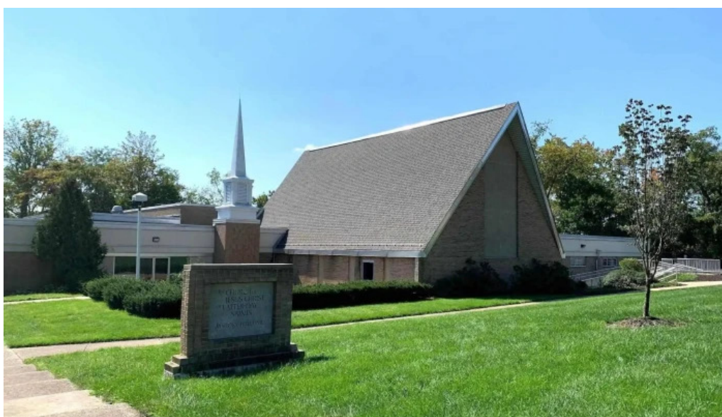
The church of jesus christ of latter day saints all