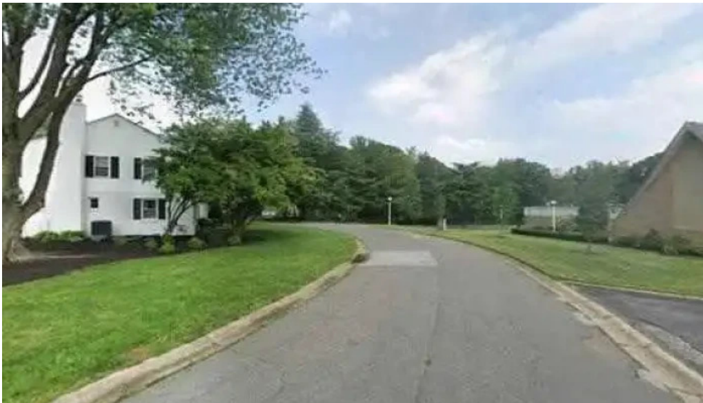
The church of jesus christ of latter day saints street view 360deg