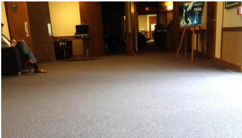
The church of jesus christ of latter day saints delaware