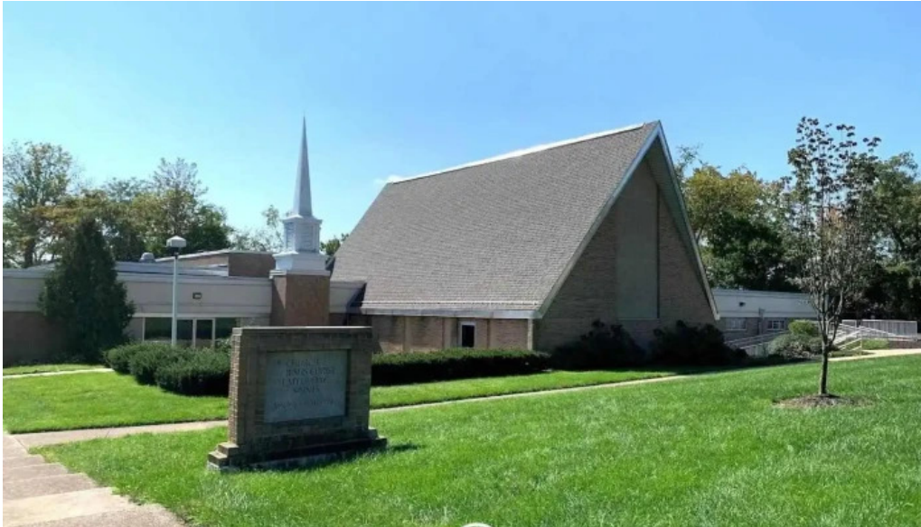
The church of jesus christ of latter day saints wilmington